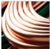
MM Kembla Copper Tube American Standard ASTM B88